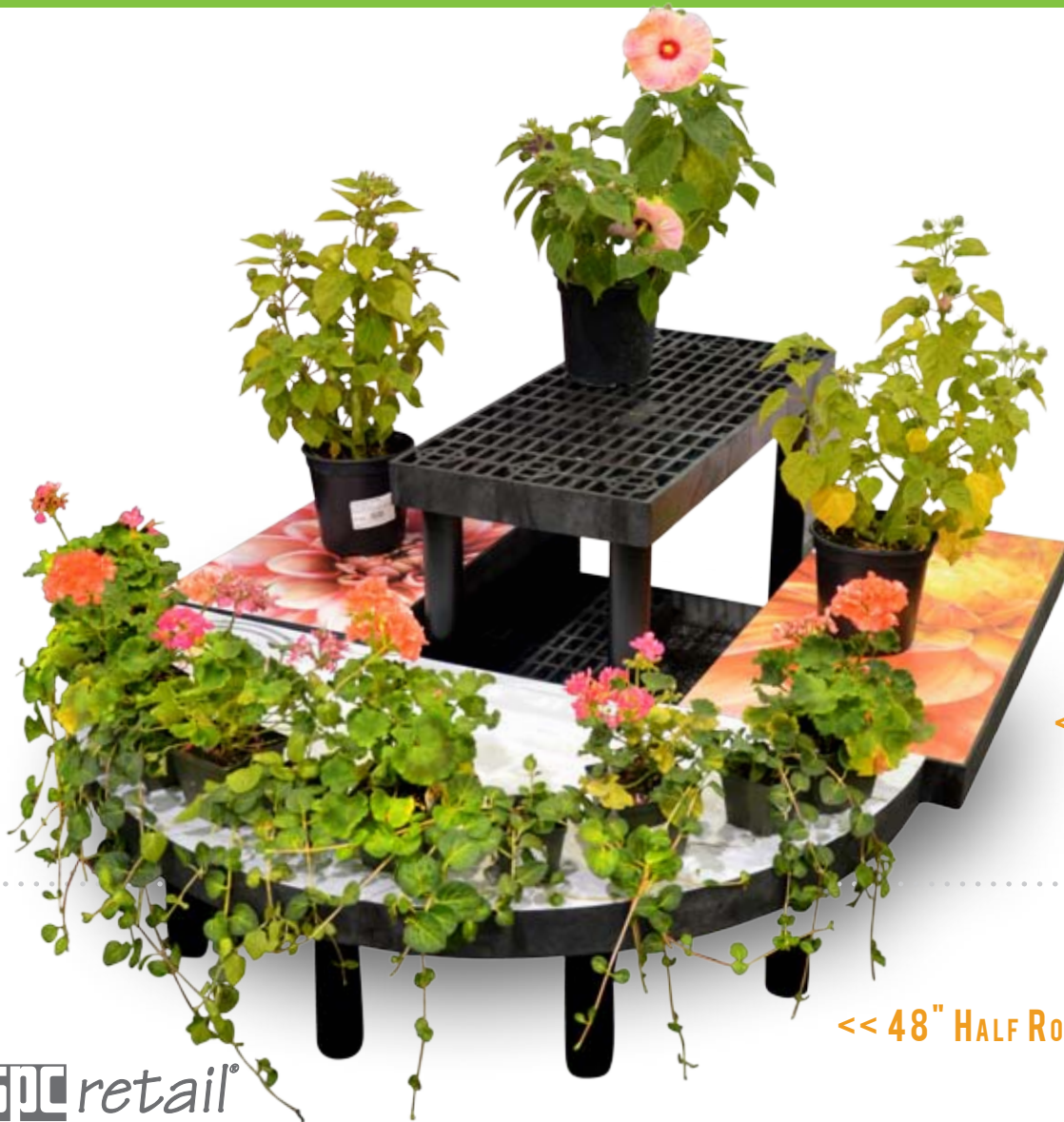
<< 3-STEP PYRAMID