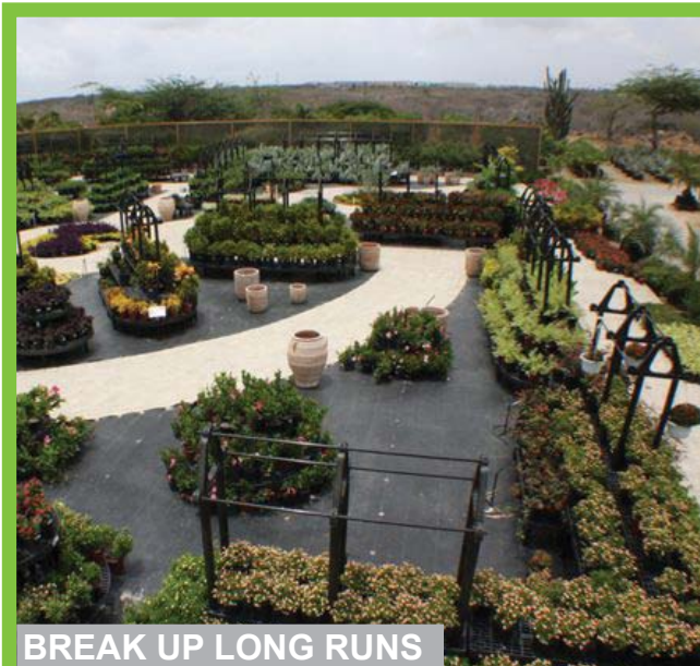
BREAK UP LONG RUNS