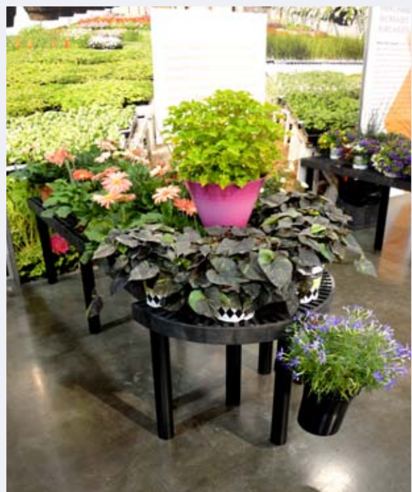
66" x 24" BENCH WITH 30" HALF ROUND END CAP