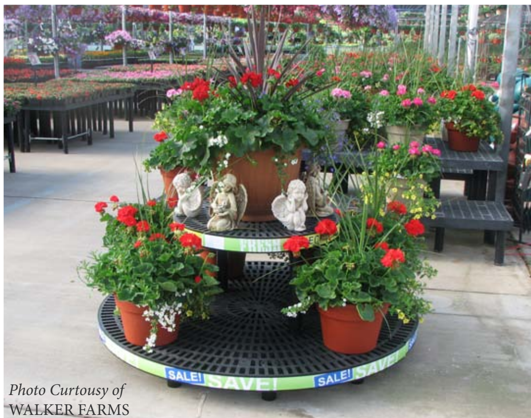
^ 2-TIER ROUND DISPLAY