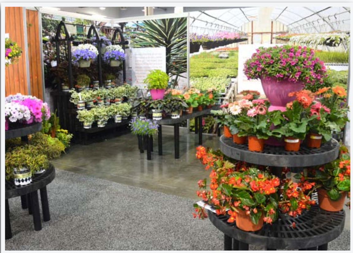
<< 2-TIER ROUND DISPLAY